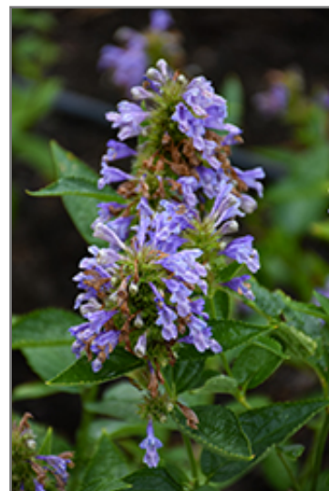
Prelude Purple Catmint flowers

Prelude Purple Catmint is recommended for the following landscape applications;