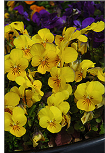
Penny Yellow Pansy flowers