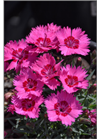
Paint The Town Fancy Pinks flowers

* This is a 'special order' plant - contact store for details