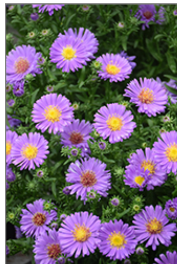
Kickin Lilac Blue Aster flowers

Kickin Lilac Blue Aster is recommended for the following landscape applications;