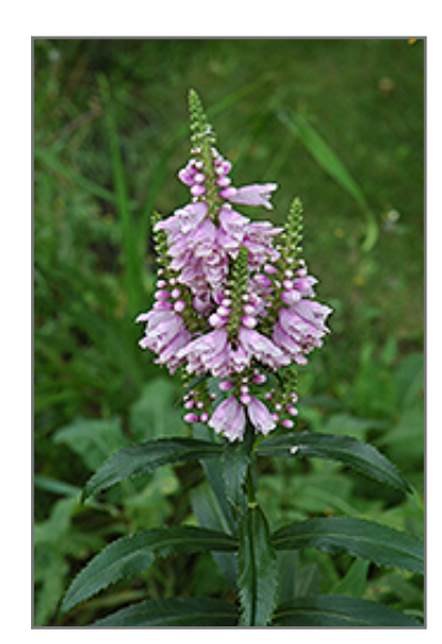
Obedient Plant flowers