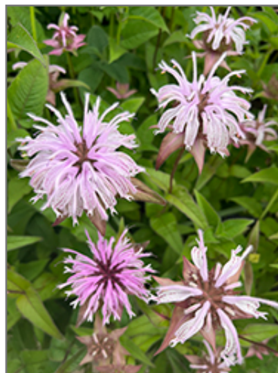
Eastern Beebalm flowers

This plant will require occasional maintenance and upkeep, and should be cut back in late fall in preparation for winter. It is a good choice for attracting bees, butterflies and hummingbirds to your yard, but is not particularly attractive to deer who tend to leave it alone in favor of tastier treats. Gardeners should be aware of the following characteristic(s) that may warrant special consideration;