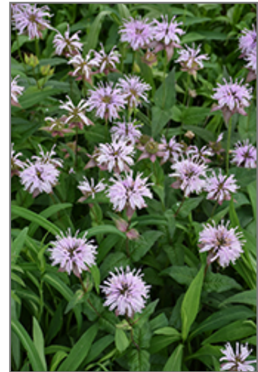
Eastern Beebalm flowers

Eastern Beebalm will grow to be about 18 inches tall at maturity extending to 24 inches tall with the flowers, with a spread of 24 inches. When grown in masses or used as a bedding plant, individual plants should be spaced approximately 20 inches apart. It grows at a fast rate, and under ideal conditions can be expected to live for approximately 5 years. As an herbaceous perennial, this plant will usually die back to the crown each winter, and will regrow from the base each spring. Be careful not to disturb the crown in late winter when it may not be readily seen!