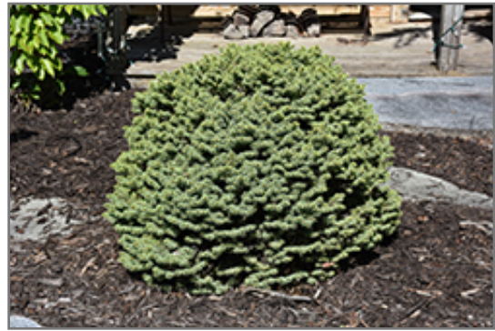
Dwarf Serbian Spruce