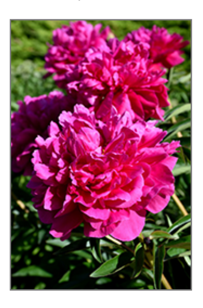
Kansas Peony flowers