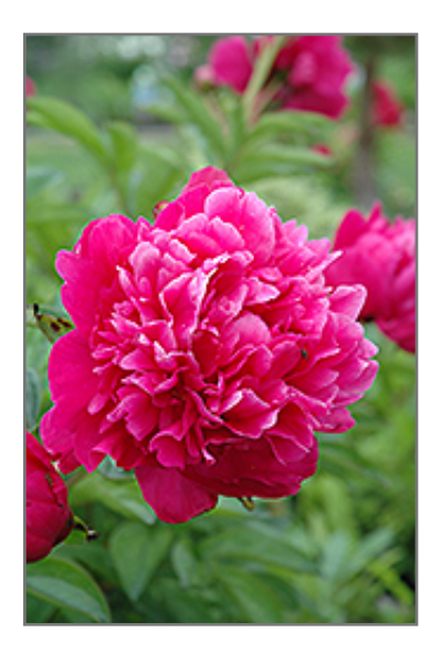
Kansas Peony flowers