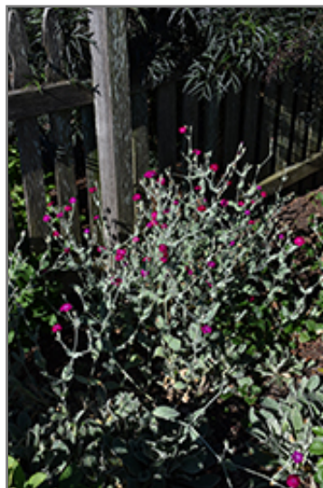
Rose Campion in bloom

BRUNSWICK 422 Bath Road Brunswick, ME 04011 1-800-339-8111 207-442-8111