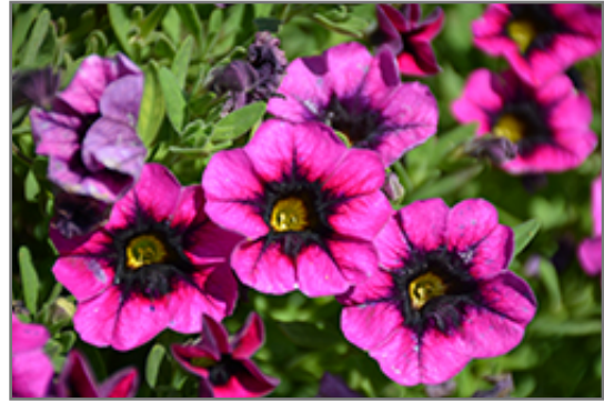
Superbells Blackcurrent Punch Calibrachoa flowers