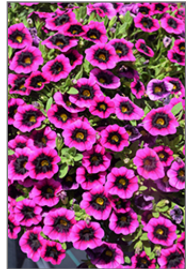
Superbells Blackcurrent Punch Calibrachoa flowers

Superbells Blackcurrent Punch Calibrachoa is recommended for the following landscape applications;