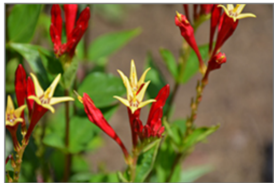
Little Redhead Indian Pink flowers

BRUNSWICK 422 Bath Road Brunswick, ME 04011 1-800-339-8111 207-442-8111