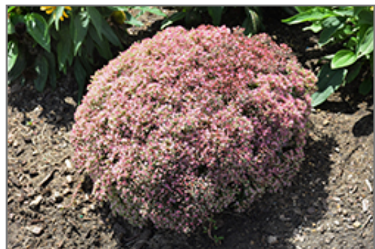
Rock 'N Round Pride and Joy Stonecrop in bloom

BRUNSWICK 422 Bath Road Brunswick, ME 04011 1-800-339-8111 207-442-8111