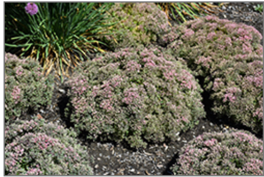
Rock 'N Round Pride and Joy Stonecrop in bloom