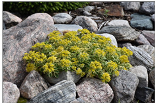
Atlantis Stonecrop in bloom

BRUNSWICK 422 Bath Road Brunswick, ME 04011 1-800-339-8111 207-442-8111