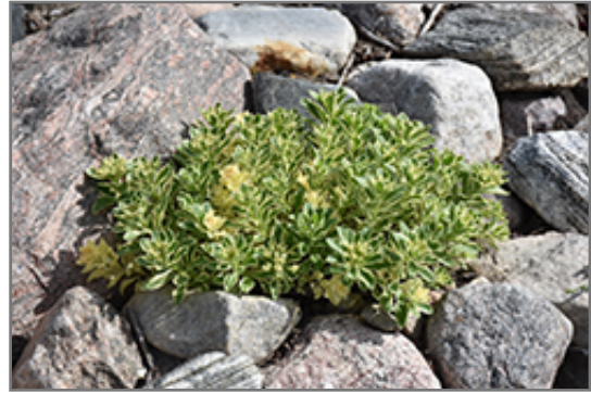
Atlantis Stonecrop