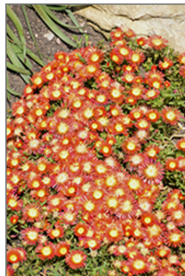
Delmara Red Ice Plant

This is a relatively low maintenance plant, and is best cleaned up in early spring before it resumes active growth for the season. It is a good choice for attracting bees and butterflies to your yard. It has no significant negative characteristics.