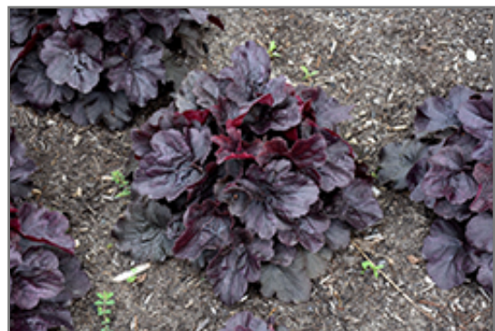
Northern Exposure Black Coral Bells

BRUNSWICK 422 Bath Road Brunswick, ME 04011 1-800-339-8111 207-442-8111