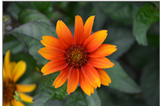
Bleeding Hearts False Sunflower flowers

Bleeding Hearts False Sunflower is an herbaceous perennial with an upright spreading habit of growth. Its medium texture blends into the garden, but can always be balanced by a couple of finer or coarser plants for an effective composition.