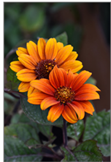
Bleeding Hearts False Sunflower flowers

BRUNSWICK 422 Bath Road Brunswick, ME 04011 1-800-339-8111 207-442-8111