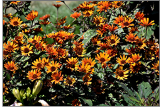
Bleeding Hearts False Sunflower flowers

* This is a 'special order' plant - contact store for details