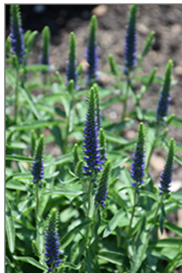
Magic Show Wizard of Ahhs Speedwell flowers

* This is a 'special order' plant - contact store for details