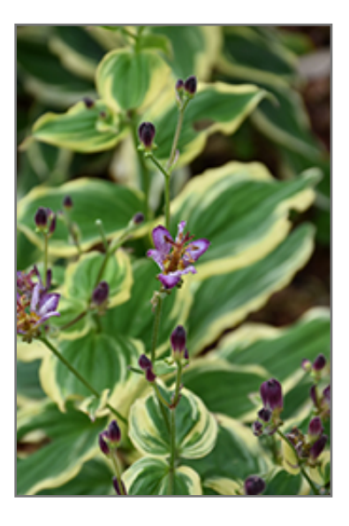
Samurai Toad Lily flowers

Samurai Toad Lily is recommended for the following landscape applications;