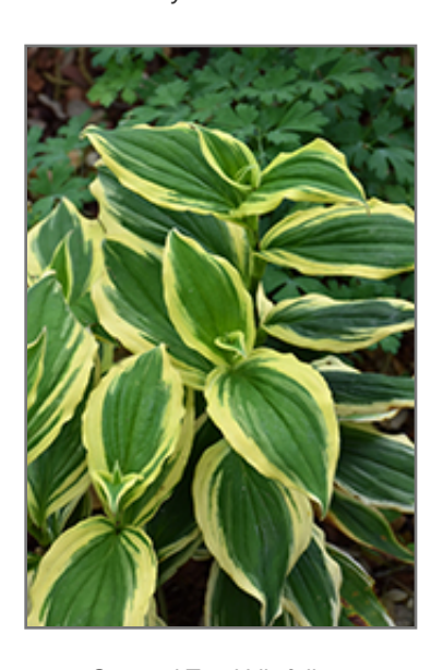
Samurai Toad Lily foliage

BRUNSWICK 422 Bath Road Brunswick, ME 04011 1-800-339-8111 207-442-8111