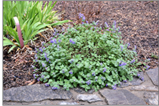
Early Bird Catmint in bloom

* This is a 'special order' plant - contact store for details