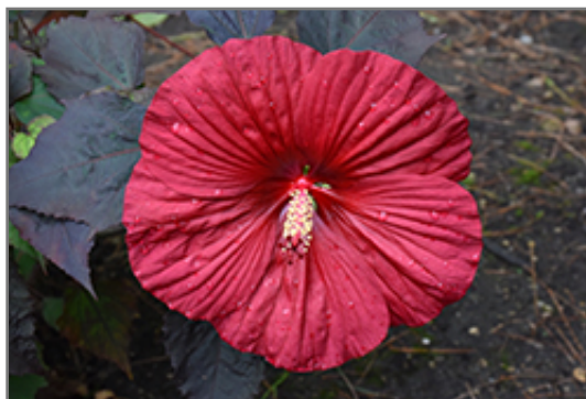
Summerific Holy Grail Hibiscus flowers

Summerific Holy Grail Hibiscus is an herbaceous perennial with an upright spreading habit of growth. Its relatively coarse texture can be used to stand it apart from other garden plants with finer foliage.