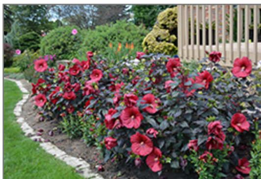
Summerific Holy Grail Hibiscus in bloom

BRUNSWICK 422 Bath Road Brunswick, ME 04011 1-800-339-8111 207-442-8111