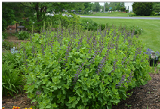
Indigo Spires False Indigo in bloom

BRUNSWICK 422 Bath Road Brunswick, ME 04011 1-800-339-8111 207-442-8111