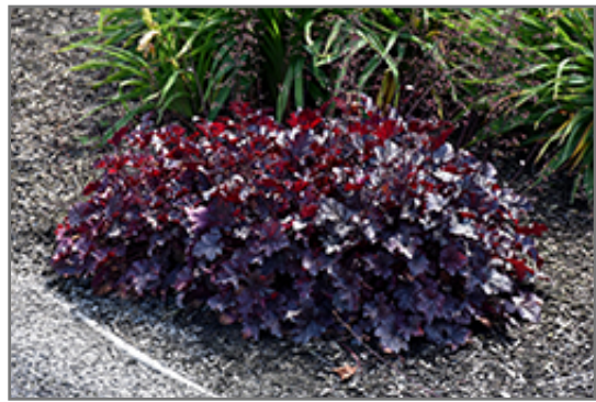
Plum Pudding Coral Bells

Plum Pudding Coral Bells will grow to be only 6 inches tall at maturity extending to 12 inches tall with the flowers, with a spread of 12 inches. When grown in masses or used as a bedding plant, individual plants should be spaced approximately 10 inches apart. Its foliage tends to remain low and dense right to the ground. It grows at a medium rate, and under ideal conditions can be expected to live for approximately 10 years. As an evergreen perennial, this plant will typically keep its form and foliage year-round.