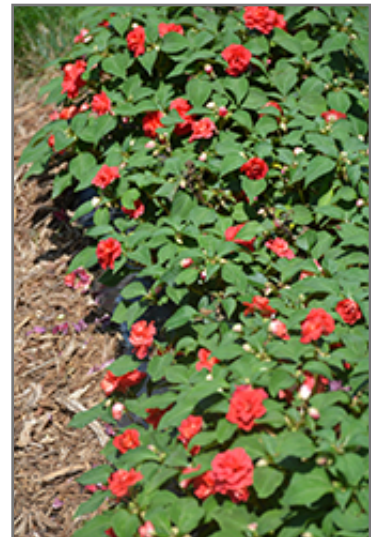
Rockapulco Red Impatiens in bloom

BRUNSWICK 422 Bath Road Brunswick, ME 04011 1-800-339-8111 207-442-8111