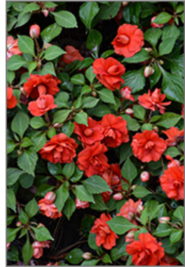
Rockapulco Red Impatiens flowers

Rockapulco Red Impatiens is a fine choice for the garden, but it is also a good selection for planting in outdoor containers and hanging baskets. It is often used as a 'filler' in the 'spiller-thriller-filler' container combination, providing a mass of flowers against which the thriller plants stand out. Note that when growing plants in outdoor containers and baskets, they may require more frequent waterings than they would in the yard or garden.