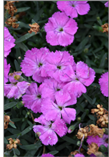
Paint The Town Fuchsia Pinks flowers

This is a relatively low maintenance plant, and is best cleaned up in early spring before it resumes active growth for the season. It is a good choice for attracting bees and butterflies to your yard, but is not particularly attractive to deer who tend to leave it alone in favor of tastier treats. It has no significant negative characteristics.