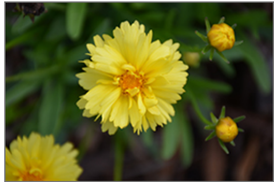
Leading Lady Charlize Tickseed flowers

Leading Lady Charlize Tickseed is recommended for the following landscape applications;