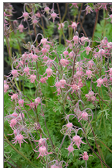
Prairie Smoke flowers

201 Gray Rd (Route 100) Cumberland, ME 04021 1-800-348-8498 207-829-5619