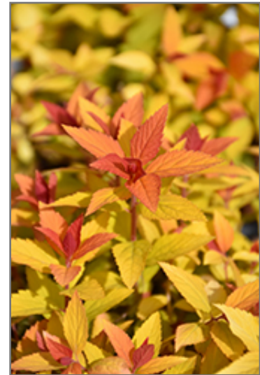
Double Play Candy Corn Spirea foliage

Double Play Candy Corn Spirea is recommended for the following landscape applications;