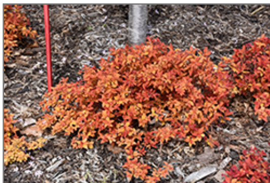
Double Play Candy Corn Spirea

This shrub should only be grown in full sunlight. It prefers to grow in average to moist conditions, and shouldn't be allowed to dry out. It is not particular as to soil type or pH. It is highly tolerant of urban pollution and will even thrive in inner city environments. This is a selected variety of a species not originally from North America.