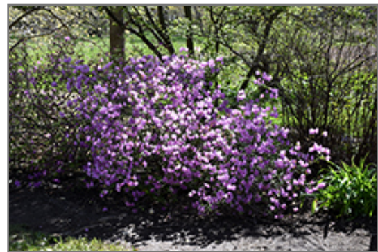
Compact Korean Azalea in bloom

BRUNSWICK 422 Bath Road Brunswick, ME 04011 1-800-339-8111 207-442-8111