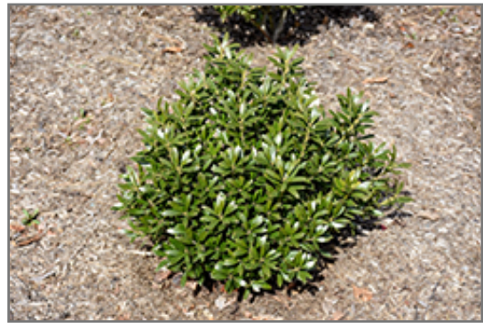
Gem Box Inkberry Holly

BRUNSWICK 422 Bath Road Brunswick, ME 04011 1-800-339-8111 207-442-8111