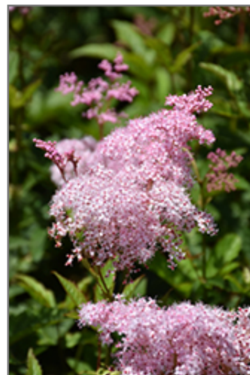
Queen Of The Prairie flowers