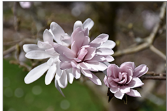
Centennial Blush Magnolia flowers

BRUNSWICK 422 Bath Road Brunswick, ME 04011 1-800-339-8111 207-442-8111