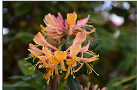
Goldflame Honeysuckle flowers