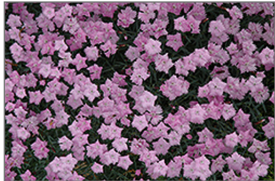
Bath's Pink Pinks in bloom

Bath's Pink Pinks is recommended for the following landscape applications;