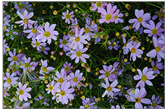
Pink Tickseed flowers

BRUNSWICK 422 Bath Road Brunswick, ME 04011 1-800-339-8111 207-442-8111