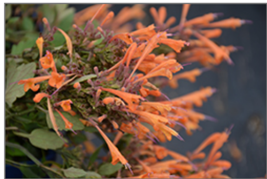
Kudos Mandarin Hyssop flowers

BRUNSWICK 422 Bath Road Brunswick, ME 04011 1-800-339-8111 207-442-8111