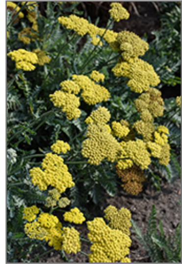
Moonshine Yarrow flowers

Moonshine Yarrow is a fine choice for the garden, but it is also a good selection for planting in outdoor pots and containers. It can be used either as 'filler' or as a 'thriller' in the 'spiller-thriller-filler' container combination, depending on the height and form of the other plants used in the container planting. It is even sizeable enough that it can be grown alone in a suitable container. Note that when growing plants in outdoor containers and baskets, they may require more frequent waterings than they would in the yard or garden.