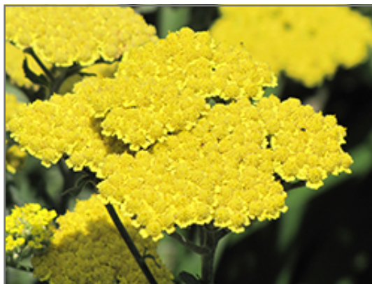
Moonshine Yarrow flowers