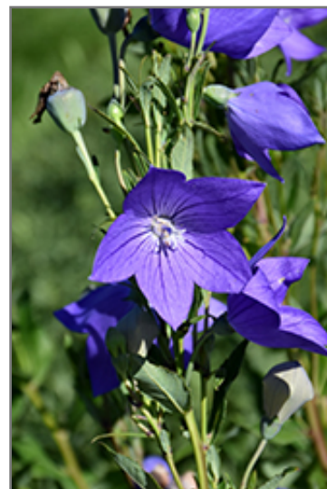
Fuji Blue Balloon Flower flowers