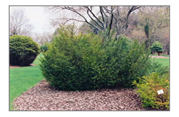
Canadian Yew

89 Foreside Road Falmouth, ME 04105 1-800-244-3860 207-781-3860