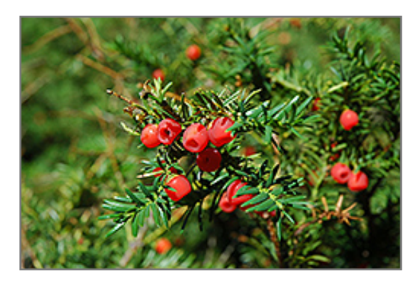
Canadian Yew fruit