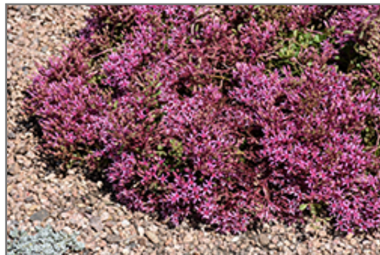
Dragon's Blood Stonecrop flowers

This plant will require occasional maintenance and upkeep, and is best cleaned up in early spring before it resumes active growth for the season. Deer don't particularly care for this plant and will usually leave it alone in favor of tastier treats. Gardeners should be aware of the following characteristic(s) that may warrant special consideration;