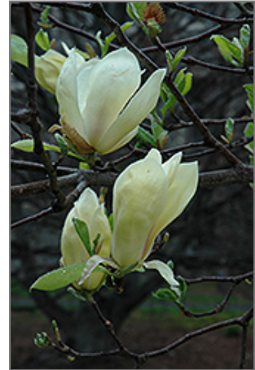
Yellow Lantern Magnolia flowers

This tree does best in full sun to partial shade. It requires an evenly moist well-drained soil for optimal growth, but will die in standing water. It is not particular as to soil type, but has a definite preference for acidic soils. It is quite intolerant of urban pollution, therefore inner city or urban streetside plantings are best avoided. Consider applying a thick mulch around the root zone in winter to protect it in exposed locations or colder microclimates. This particular variety is an interspecific hybrid.