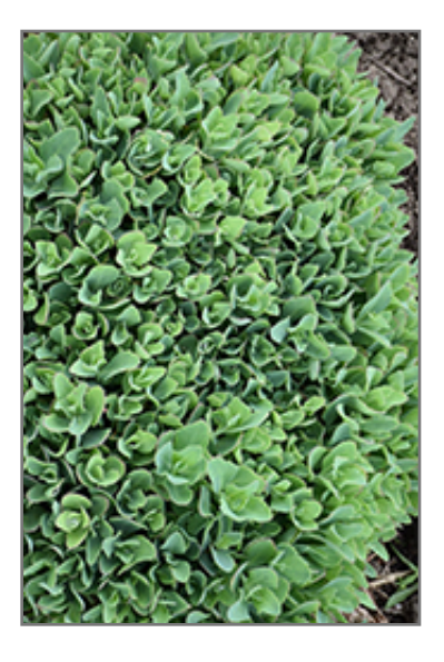
Carl Stonecrop foliage

Carl Stonecrop will grow to be about 16 inches tall at maturity, with a spread of 24 inches. When grown in masses or used as a bedding plant, individual plants should be spaced approximately 18 inches apart. Its foliage tends to remain dense right to the ground, not requiring facer plants in front. It grows at a fast rate, and under ideal conditions can be expected to live for approximately 15 years. As an herbaceous perennial, this plant will usually die back to the crown each winter, and will regrow from the base each spring. Be careful not to disturb the crown in late winter when it may not be readily seen!