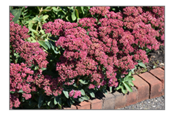
Carl Stonecrop in bloom

This is a relatively low maintenance plant, and is best cleaned up in early spring before it resumes active growth for the season. It is a good choice for attracting bees and butterflies to your yard, but is not particularly attractive to deer who tend to leave it alone in favor of tastier treats. It has no significant negative characteristics.