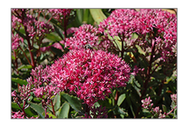
Carl Stonecrop flowers