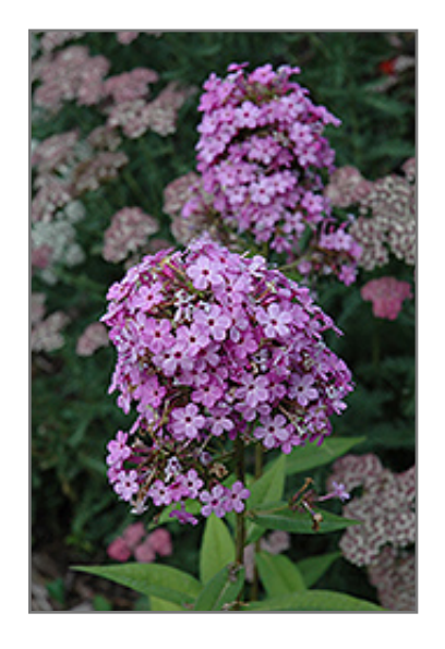
Jeana Garden Phlox flowers

Jeana Garden Phlox is a dense herbaceous perennial with an upright spreading habit of growth. Its medium texture blends into the garden, but can always be balanced by a couple of finer or coarser plants for an effective composition.