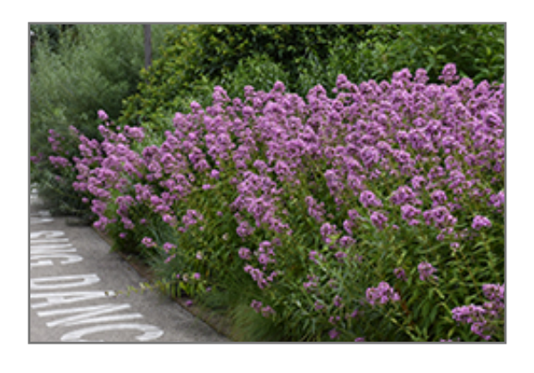
Jeana Garden Phlox in bloom

This plant will require occasional maintenance and upkeep, and should be cut back in late fall in preparation for winter. It is a good choice for attracting butterflies and hummingbirds to your yard. Gardeners should be aware of the following characteristic(s) that may warrant special consideration;