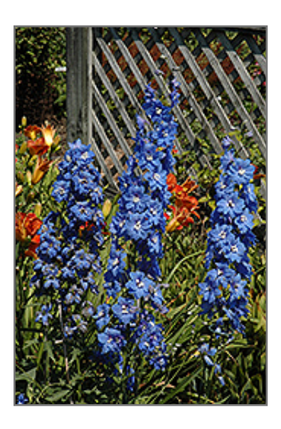
Cobalt Dreams Larkspur flowers

A magnificent display of radiant, cobalt-blue flowers on towering spikes with contrasting white bee; good vertical form, dense flower spikes and strong stems; excellent uniformity is perfect for along borders