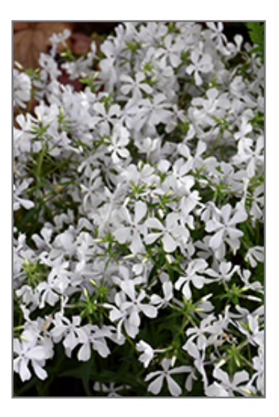
May Breeze Phlox flowers

A lovely variety with starry, pale powder-blue, fragrant flowers that bloom in mid-spring to early summer; a wonderful plant for borders and edging; not prone to mildew, and grows best in slightly dry conditions