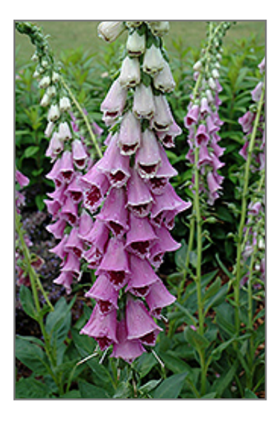
Sugar Plum Foxglove flowers

Exciting lavender-pink tubular flowers with white interiors and dark burgundy spots; tall spikes rise above attractive green lance-shaped leaves; a biennial that's happiest in part shade with adequate moisture