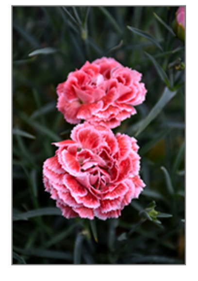
Coral Reef Pinks flowers

Coral Reef Pinks is an herbaceous evergreen perennial with a mounded form. It brings an extremely fine and delicate texture to the garden composition and should be used to full effect.