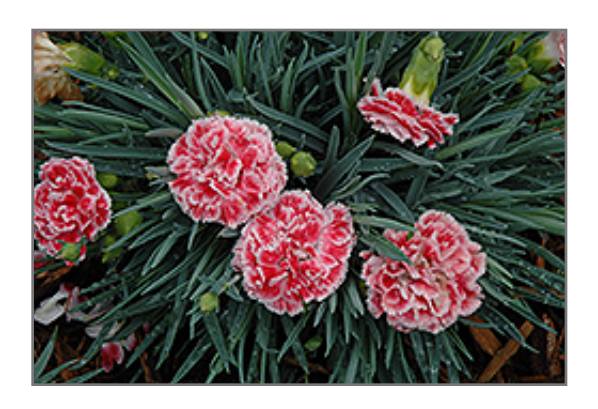
Coral Reef Pinks flowers

This is a relatively low maintenance plant, and is best cleaned up in early spring before it resumes active growth for the season. It is a good choice for attracting bees and butterflies to your yard, but is not particularly attractive to deer who tend to leave it alone in favor of tastier treats. It has no significant negative characteristics.