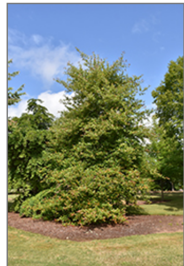
Wildfire Black Gum

BRUNSWICK 422 Bath Road Brunswick, ME 04011 1-800-339-8111 207-442-8111