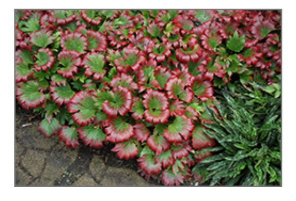
Karasuba Mukdenia

Karasuba Mukdenia features dainty spikes of white bell-shaped flowers rising above the foliage from early to mid spring. Its attractive glossy fan-shaped leaves emerge coppery-bronze in spring, turning dark green in color with prominent crimson tips throughout the season.