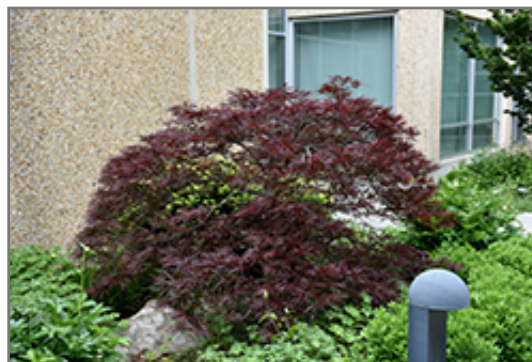
Red Dragon Japanese Maple

This is a relatively low maintenance tree, and should only be pruned in summer after the leaves have fully developed, as it may 'bleed' sap if pruned in late winter or early spring. It has no significant negative characteristics.