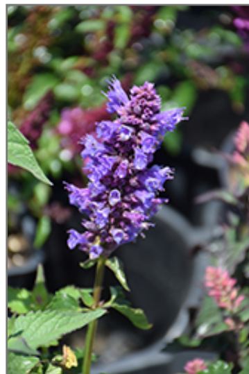
Blue Boa Hyssop flowers